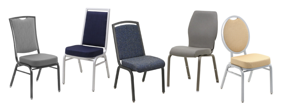
Access, Classic, Elite, Encore, Eon, & Essential II Banquet Chairs

4-Wheel Comfort Seating Cart (holds 10 chairs)