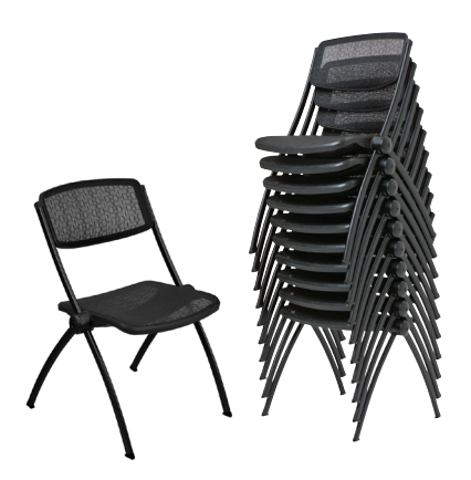
MeshOne™ Stacking Chair

Stacking Chair Cart – 2 Wheel (holds 10 chairs)