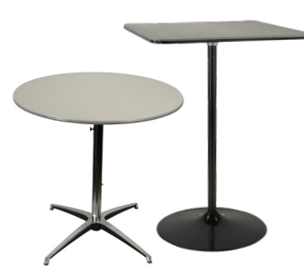
ABS Cocktail Table (24" to 36")