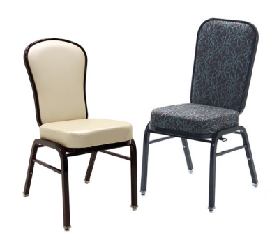
Regency Banquet Chair

Comfort Seating PS Cart (holds 10 chairs)