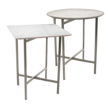
Elevare Cocktail Table (30"x30" or 36"x36")