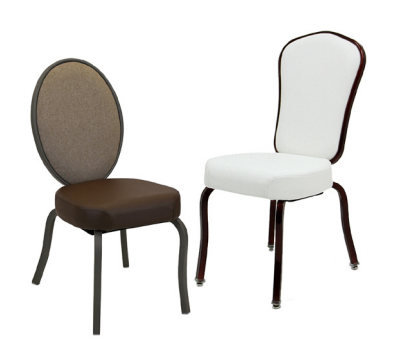
Prestige Banquet Chair

Comfort Seating Pan Cart (holds 8 chairs)