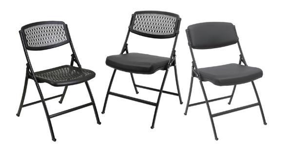
FlexOne® CS, FX, & LX Folding Chairs

(holds 76 chairs; requires forklift and x-base when