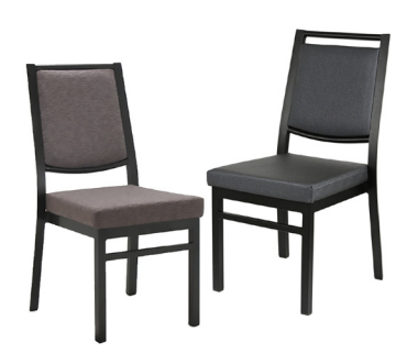
Grand Banquet Chair

High-Capacity Push Cart or Stacking Cart