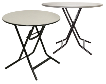
ABS Expediter Table (30" to 42")

((31" holds 7-8 tables, 38" holds 9-10 tables) *only holds 60", 66", and 72" tables)