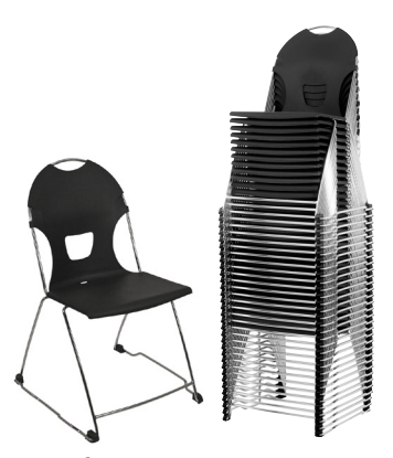
SwiftSet HD Stacking Chair