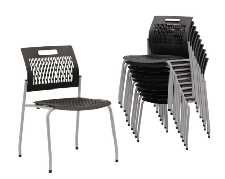
Adapt Stacking Chair