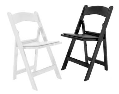
DuraMax™ Folding Chair

(holds 58 chairs; requires forklift and x-base when stacking)