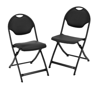
SwiftSet Upholstered Folding Chair

SwiftSet Folding Chair Cart – Flat (holds 45 chairs)