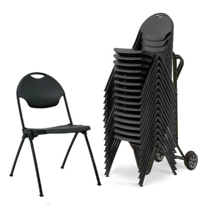
SwiftSet Stacking Chair

Multi-Function Chair Cart (holds 14 chairs)