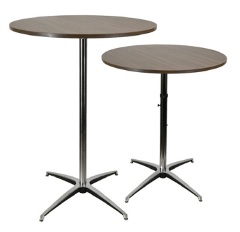
Reveal Linenless Cocktail Table (30", 36" and 30"x30")

XpressPort® Cocktail Cart (holds 12-14 tables)