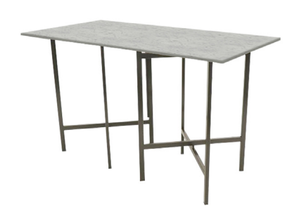
Elevare Buffet Table (30"x72" or 36"x72")

Elevare Leg-Only Cart (holds 20 Elevare Legs)