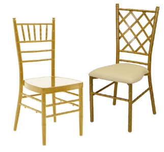
Aluminum Chiavari Chair

XpressPort® XpressLink Cart (holds 10 chairs)